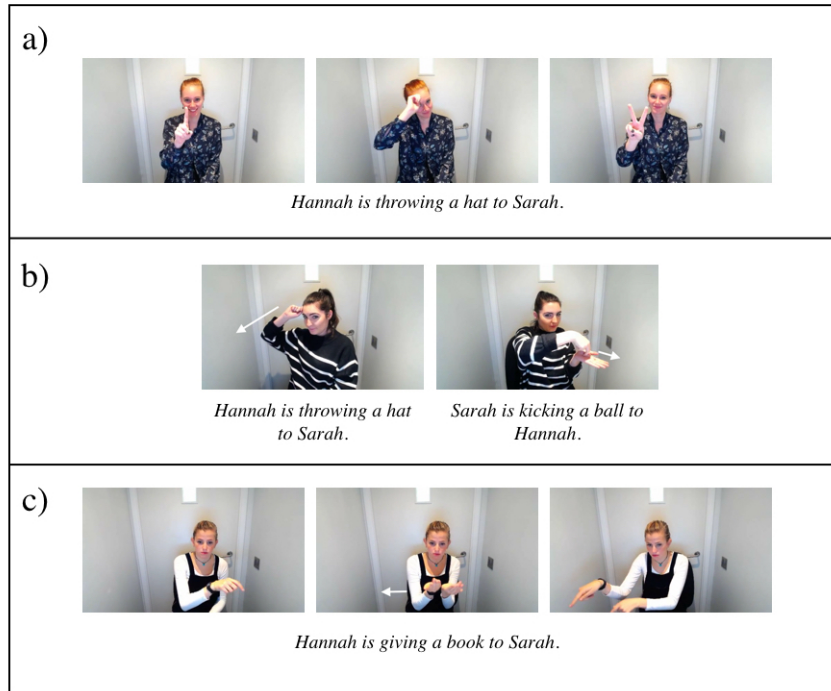
Figure 2: Examples of differentiation strategies used in the experiment. (a) shows an example of the lexical strategy, in which the participant uses 1- and 2-handshapes to denote arguments. (b) shows a participant using body orientation to denote sentence arguments. (c) illustrates the indexing strategy, in which the participant indexes locations to refer to sentence arguments.