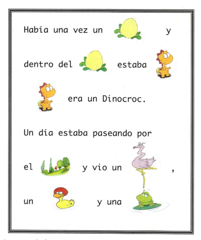
Fig. 1 Sample of pictogram for format 1

Hocus en el parque… para leer y aprender el vocabulario con los gestos.