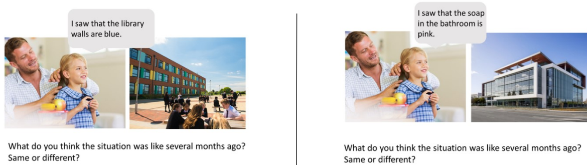
Figure 1. Example stimuli. Left panel shows familiar (school) condition. Picture text was read out for children.

Participants (children on Zoom, adults via Qualtrics) were introduced to a speaker “Suzy” who is talking to their dad about their day (see Figure 1). Speaker knowledgeability was manipulated by the location that Suzy talked about, either a familiar location (school) or an unfamiliar location (the Prime Minister’s offices). Suzy made a statement (e.g. “I saw that the library walls are blue”, read aloud by the experiment for children, presented as text for adults), and participants were asked “What do you think the situation was like several months ago? Same or different?”